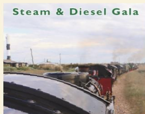
Steam & Diesel Gala