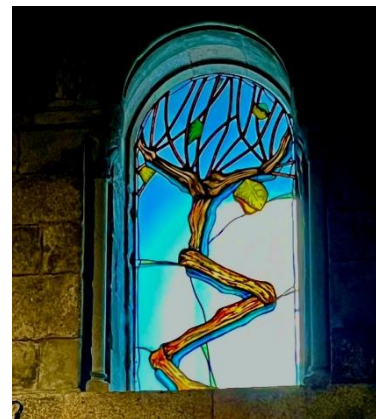
Chapel window in Cathedral in Santiago de Compostela

How often do you contemplate a stained-glass window? Maybe your mind and eye drifts during a service or you visit a church and your gaze falls upon the striking image portrayed in stained glass. For example, I have always been very moved by our east window at St Leonard's which accosts one almost immediately on entering the church.