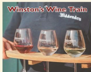
Winston's Wine Train